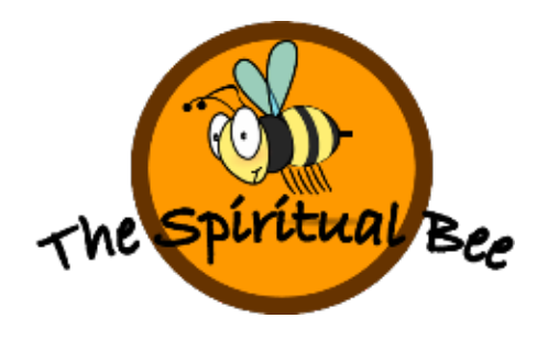
For more FREE books visit: www.spiritualbee.com