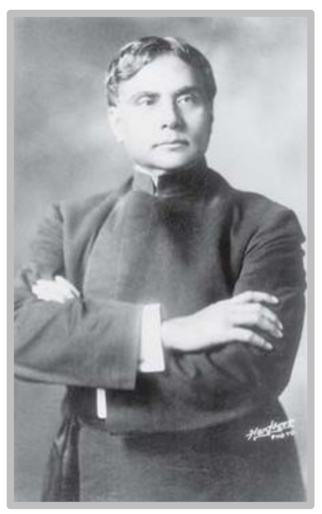
A lecture delivered before,